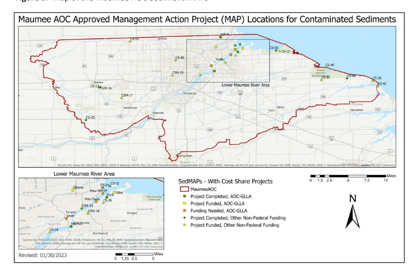
Figure 1: Map of the Maumee AOC Sediment MAPs